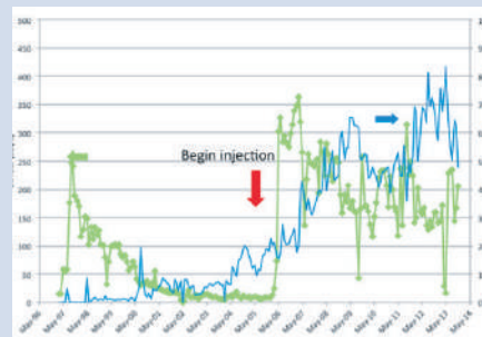
Well 15-34-081-22W4 production history

References: SPE165234, SPE166256, SPE164083, SPE27819, SPE28601, SPE169673, SPE169715, SPE171105, SPE174050, SPE180739, SPE180852, SPE181499, OTC25919, SPE190415, SPE190180.